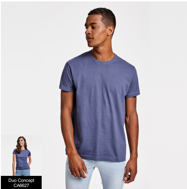
Duo Concept CA6627